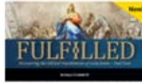
Fulfilled: Uncovering the Biblical Foundations of Catholicism (Part Two)