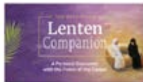
The Assisi Lenten Companion