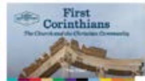
First Corinthians: The Church and the Christian Community