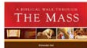
A Biblical Walk Through The Mass