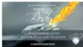
An Introduction to the Theology of the Body