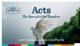
Acts: The Spread of the Kingdom