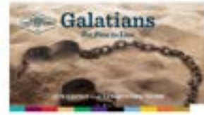
Galatians: Set Free to Live