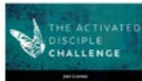
The Activated Disciple Challenge