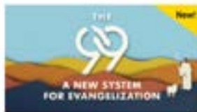
The 99: A New System for Evangelization