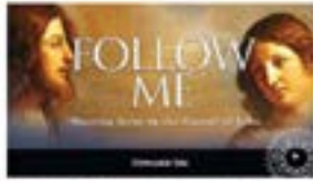
Follow Me: Meeting Jesus in the Gospel of John