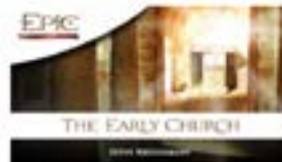
Epic: The Early Church