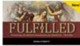
Fulfilled: Uncovering the Biblical Foundations of Catholicism (Part One)