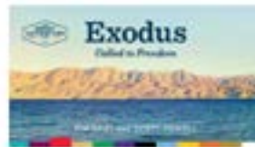
Exodus: Called to Freedom