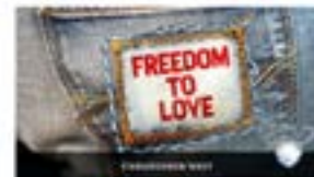
Freedom to Love