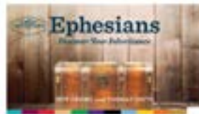
Ephesians: Discover Your Inheritance